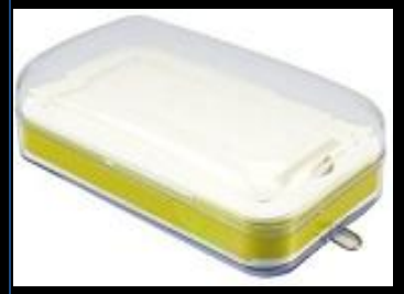
Cloth draw-string pouch & Box